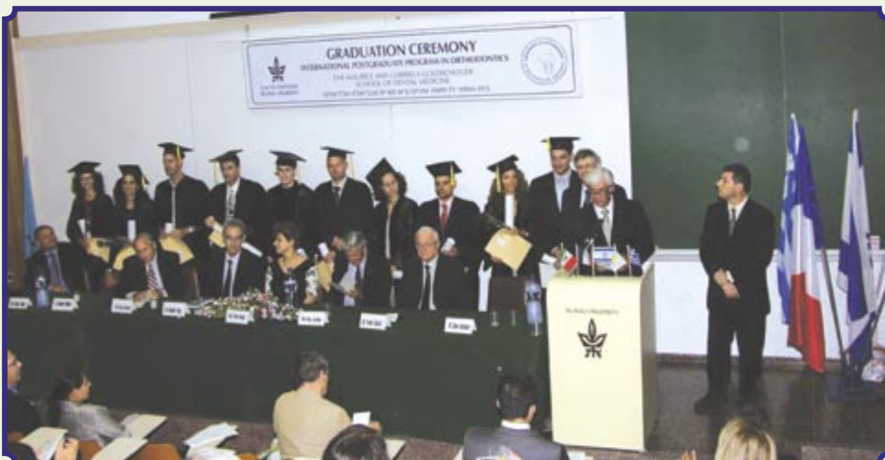
The graduation ceremony of the 5 th class of the International Postgraduate Program in Orthodontics

The ceremony was attended by the Rector and other University representatives, families of the graduates